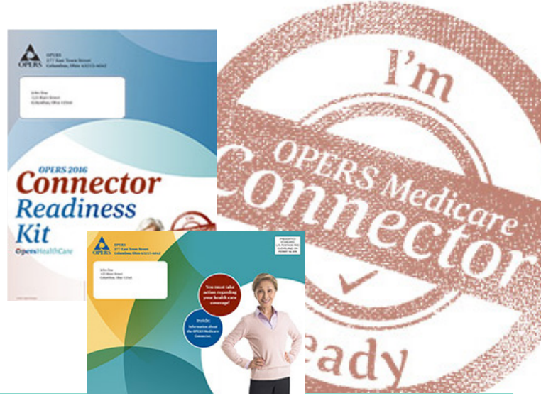
Employer Outreach | Fourth Quarter